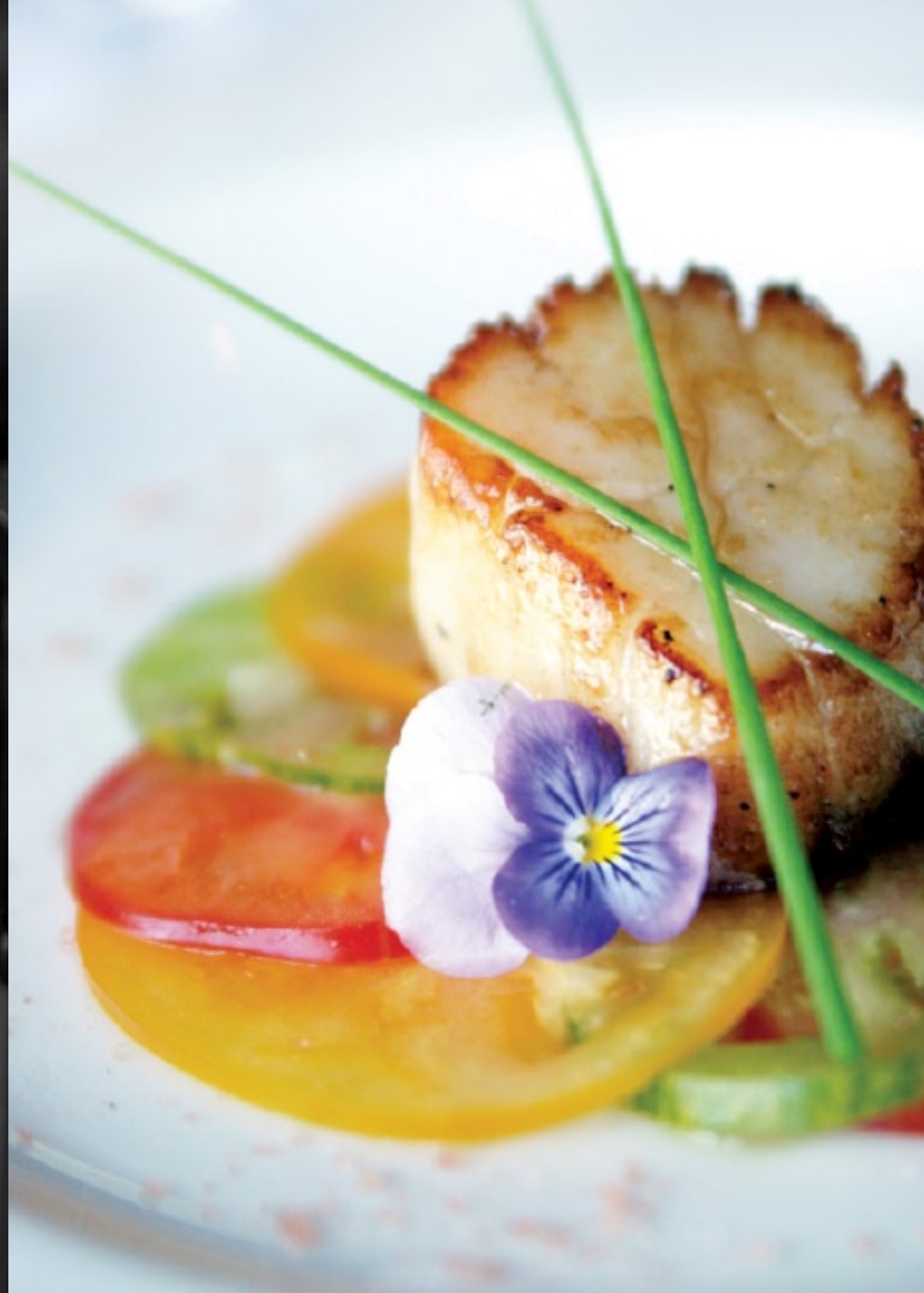
PLATE NO. 02