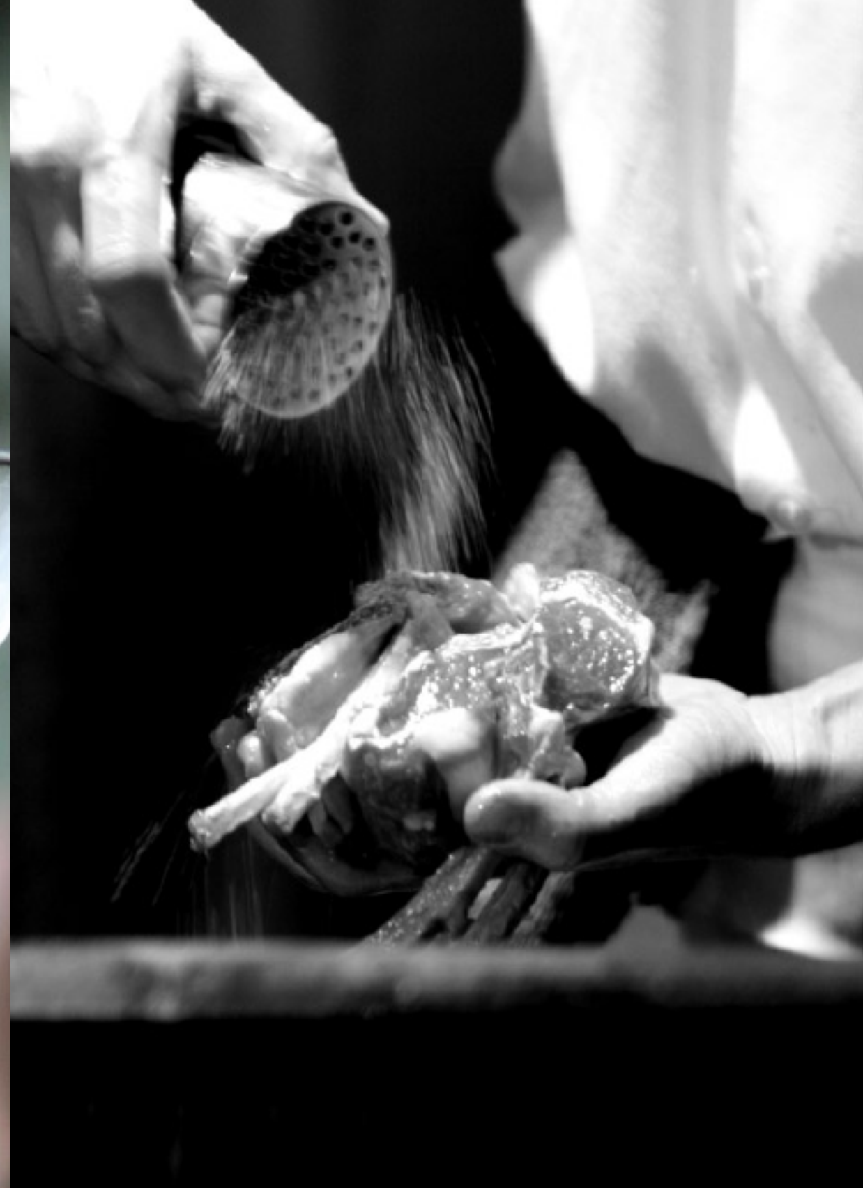
PLATE NO. 04