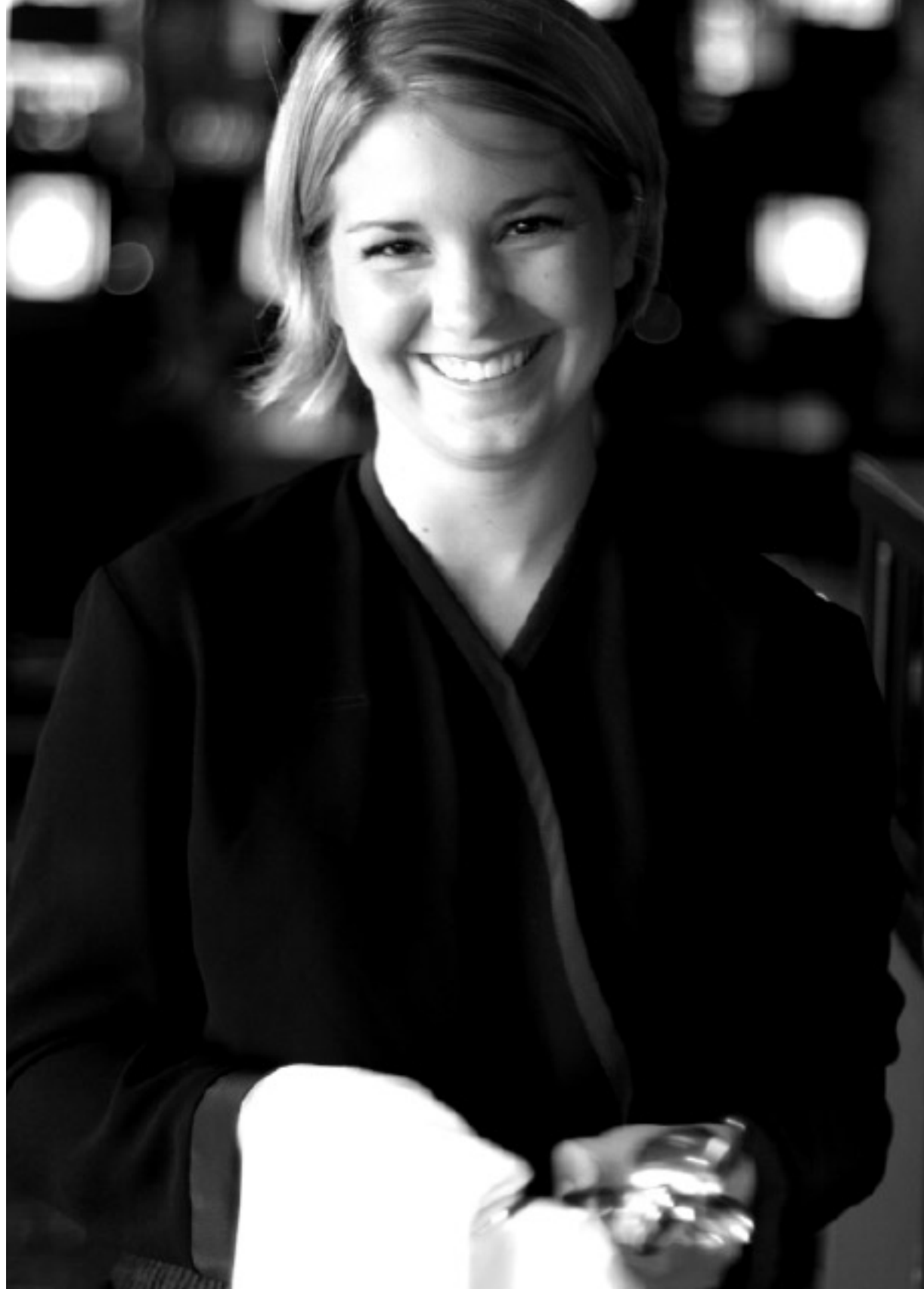
PLATE NO. 01