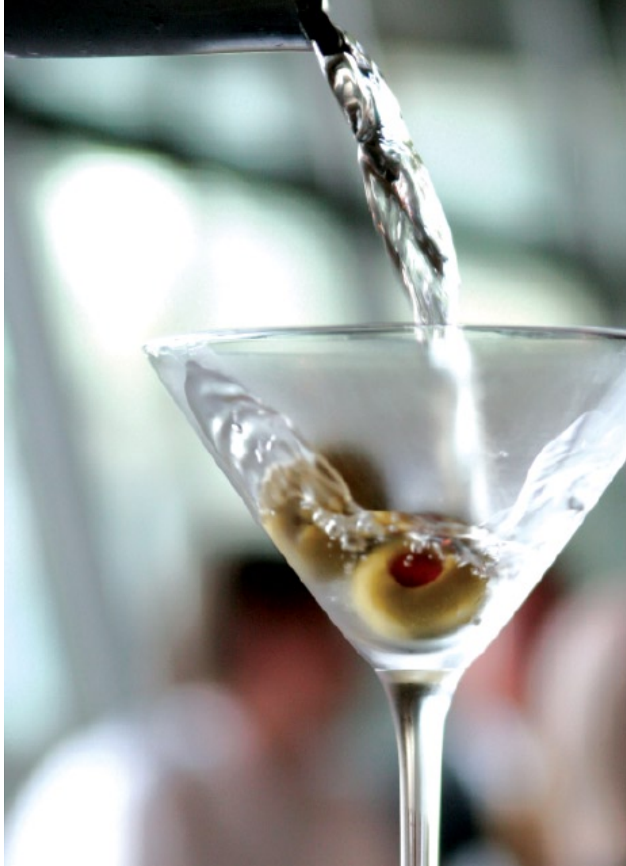
PLATE NO. 03