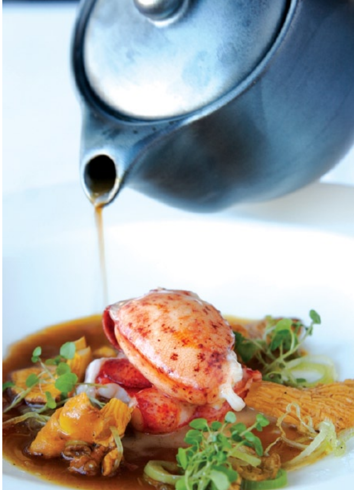
PLATE NO. 08