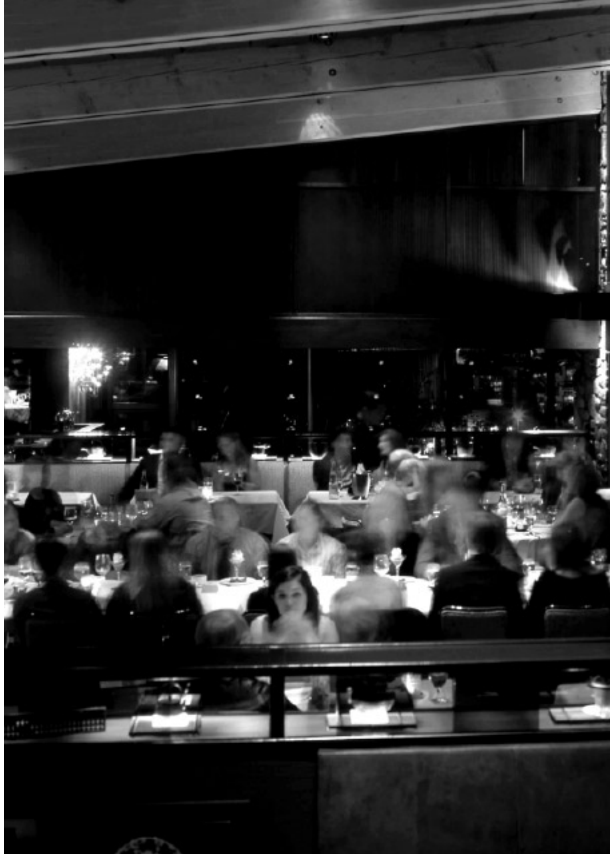
PLATE NO. 06