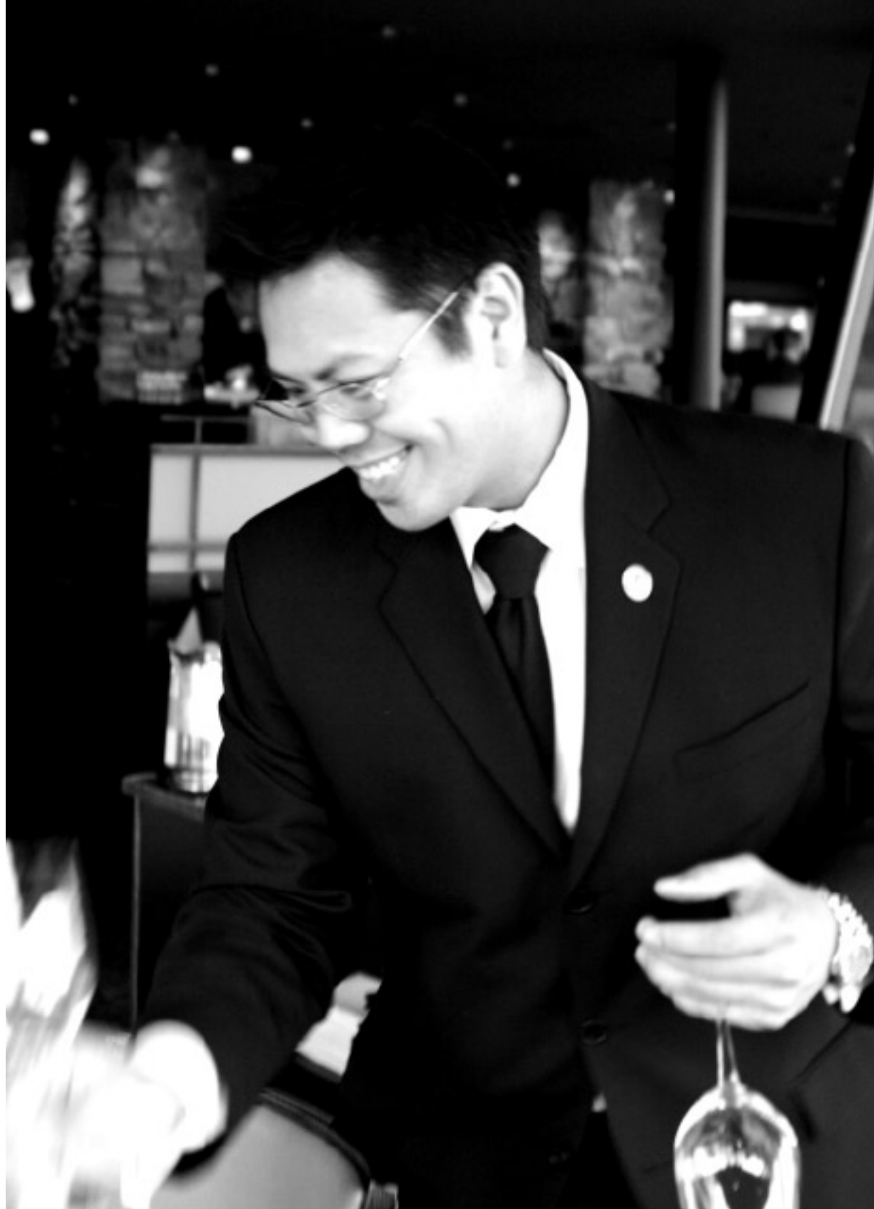
PLATE NO. 10